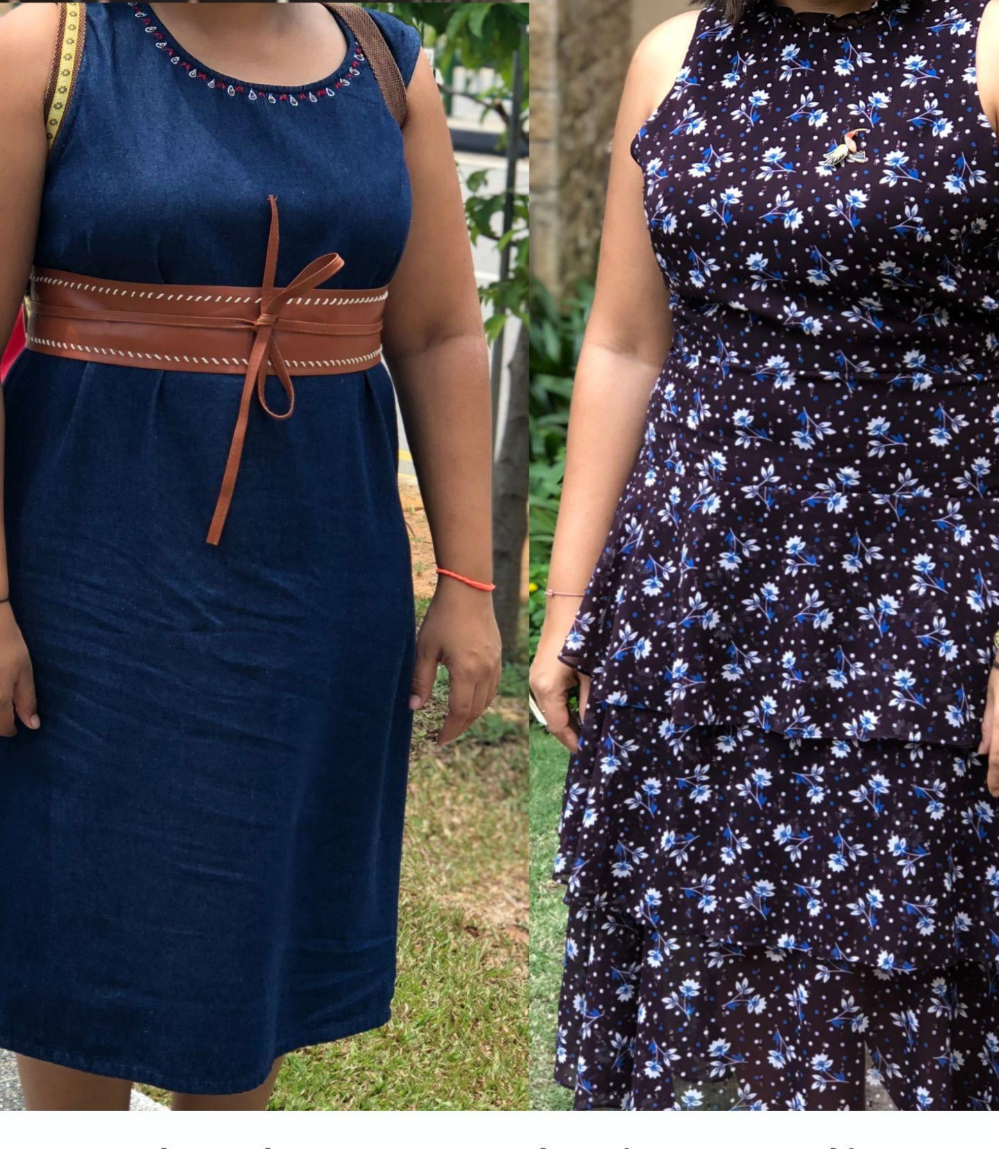
Body Shape Analysis + Styling